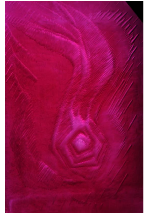
Gold purpur glass