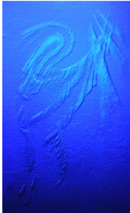
cobalt blue glass

Searching for an essential expression of metal- and colour quality in glass, she found light gestures and rhythm in the colours of particular glasses and created motive, which starts to “speak”, when light is falling through..